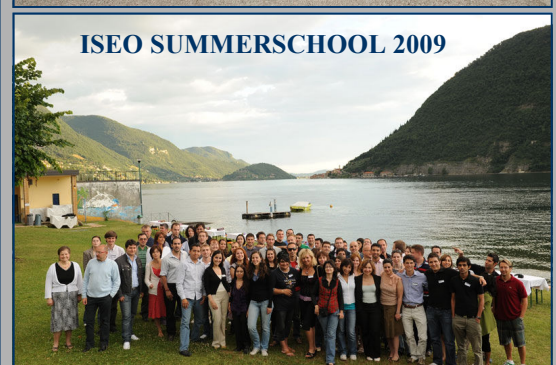
ISEO SUMMERSCHOOL 2009