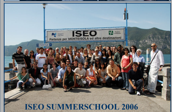
ISEO SUMMERSCHOOL 2006