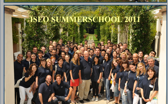
ISEO SUMMERSCHOOL 2011