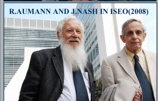
R.AUMANN AND J.NASH IN ISEO(2008)